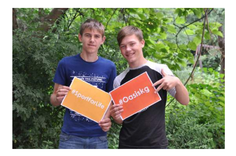
Pic.№1 Our care leavers participating in awareness-raising campaign

The main area where we are behind on our strategy is the development of additional income streams, particularly through the providing trainings and consultation for business.