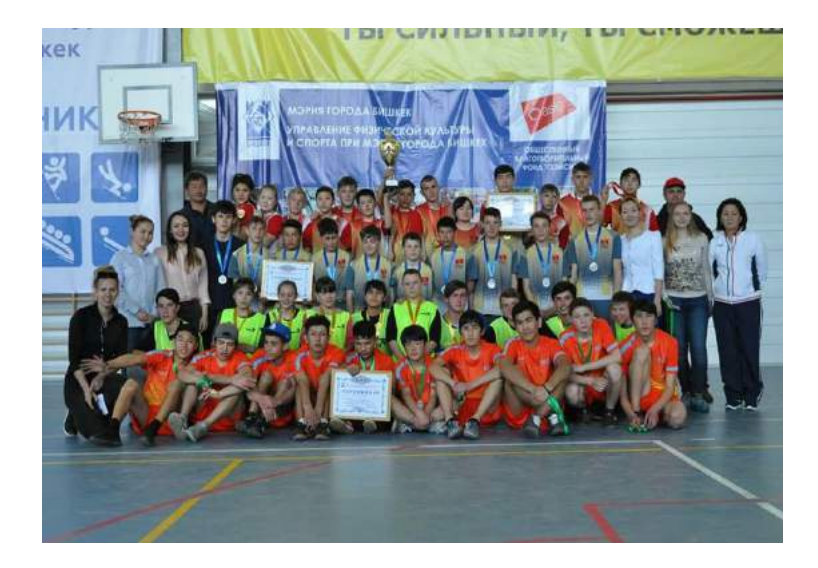
Pic.№2 Oasis Team provides tournament for children without parental care and care leavers