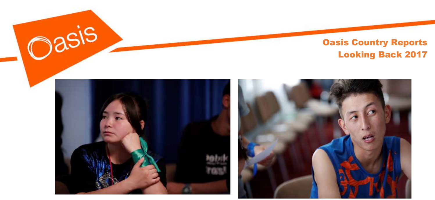
Participants of Bilim-Belek Program

Every day increases the number of people, who are ready to support young people' education and invest in their future. In 2017 (last 6 months) we collected 38 200 som. Reports will be twice a year (February and July) after each semester.